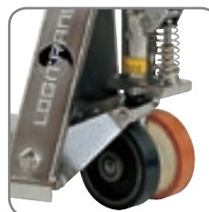
Different wheel types, to suit the needs of the user.