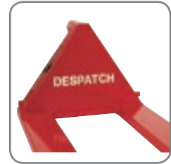
The company name or logo can be cut out in the triangle of the Panther.