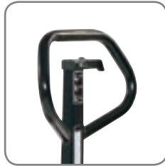
Ergonomic handle ensures the user a relaxed hold. Can be marked with name/department.

Stainless and explosion proof pallet trucks are also available.