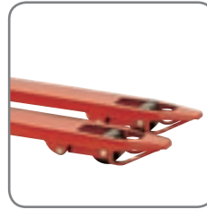
The hoop skates on the forks ensure an easy fork insertion and withdrawal in/out of pallets.