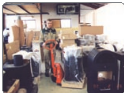
An easy handling of goods is ensured even in very confined spaces.