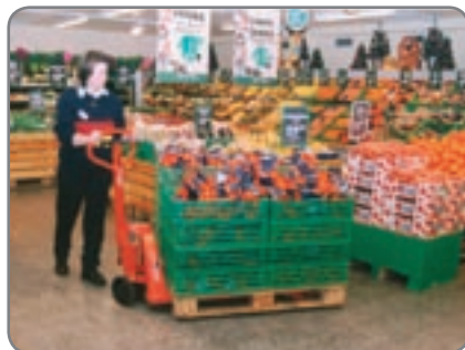
Adjustable fork height - no problems when handling low and worn pallets.