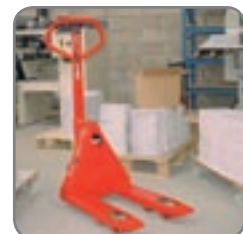
Panther is available with different fork lengths.