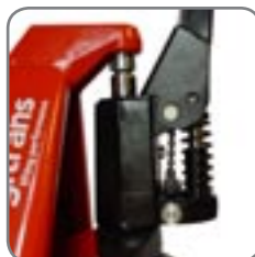
Permanent quick lift.