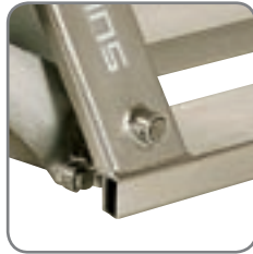
Completely open or completely closed truck elements facilitate efficient cleaning.