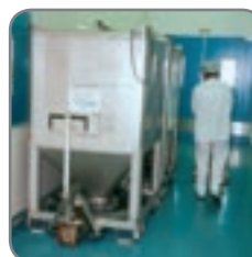
RF-PLUS pallet truck being used in the pharmaceutical industry.