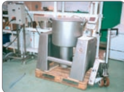
RF-PLUS - for the food industry and the pharmaceutical industry with strict hygiene and sanitation requirements.

* Holes in the forks for the wheel holder.