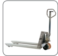
The pallet truck is also available in an explosion proof version.