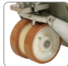
Wheels with rubber-sealed bearings.

Please ask for specification details or visit our website www.logitrans.com . We also offer tailor-made solutions.