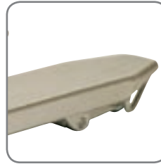
Closed forks mean easy cleaning and few hiding places for bacteria.