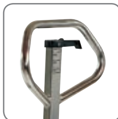
Ergonomic handle ensures the user a relaxed hold.