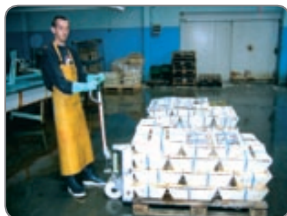
RF-SEMI - for the food industry in areas, where hygiene demands are not so high, but corrosion resistance important.