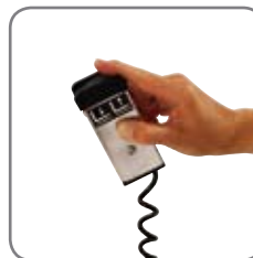
Remote control is available as optional extra (EHL).