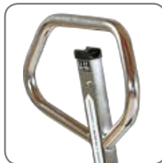
Ergonomic handle ensures the user a relaxed hold.