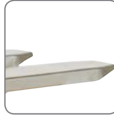
Closed forks mean easy cleaning and few hiding places for bacteria.