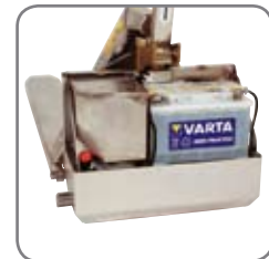
Watertight casing of the lifting motor (EHL RF-PLUS).

Please ask for specification details or visit our website www.logitrans.com . We also offer tailor-made solutions.