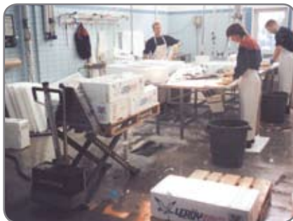
RF-SEMI - for the food industry in areas, where hygiene demands are not so high, but corrosion resistance important.