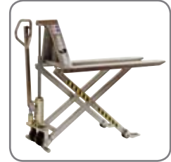
The manual highlifter is also available in an explosion proof version.