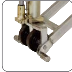
Optimum safety through supporting feet at steering wheel and central location of all control buttons on the handle.