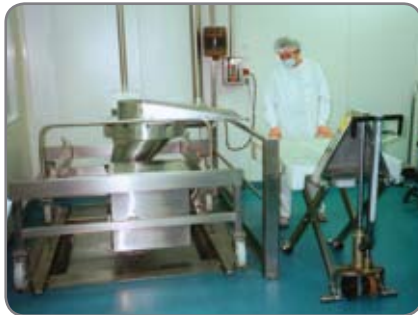
RF-PLUS - for the food industry and the pharmaceutical industry with severe demands for hygiene and cleaning.