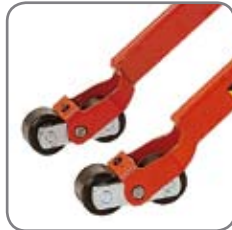
The tandem wheels have a brake effect and are not hostile to the floor.