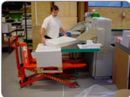
Very low power for the pump function, foot protection and neutral position are important features of HL 1005.

* The capacity changes from 1500 to 1000 kg at the lifting height 400 mm.