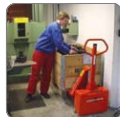
Patented cylinder construction gives low overall height.