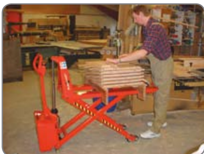
Optional extras: remote control, level control, brake, separate or built-in charger.