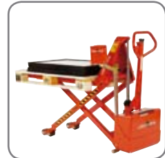
Level control (optional extra) ensures a constant working height.