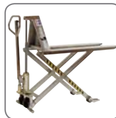
Available as manual, electric, stainless and explosion proof.