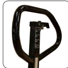
Ergonomic handle ensures the user a relaxed hold.