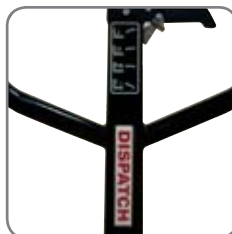
Can be marked with name/department.