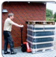
The Basic shown being used moving a pallet of beer bottles.