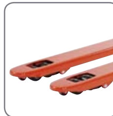
Available with single or tandem fork wheels.