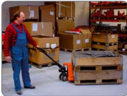
The Basic pallet truck is shown being used in the component industry.