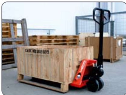
The Basic shown being used in the packaging industry.