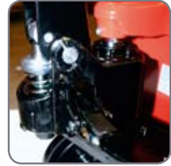
Reliable leak-proof hydraulic system.