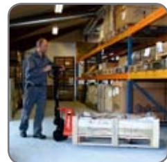
The Basic shown being used in a storage area.

Please ask for further information or visit our website www.logitrans.com .