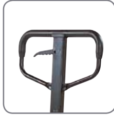
Rubber covered handle ensures a comfortable hold.