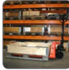
The Basic shown being used in the component industry moving heavy goods.